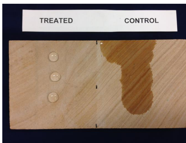
Figure 1. Surface Beading Achieved by Emulsion GPE50P

EMULSION GPE50P can achieve a near equivalent surface beading to the treated substrate compared to that of a solvent-based silane/siloxane sealer. Figure 1 shows good surface beading effect of a sandstone treated with EMULSION GPE50P at 1:9 dilution (left: treated and right control).