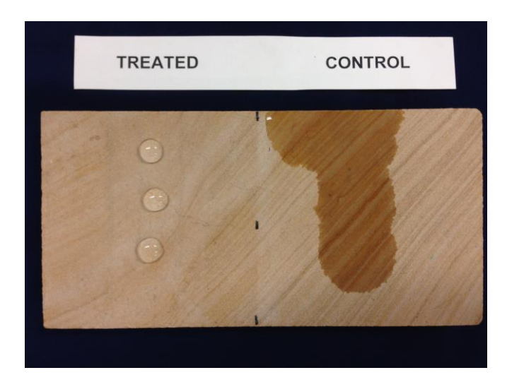
Figure 1. Surface Beading Achieved by Emulsion GPE50P

EMULSION GPE50P can achieve a near equivalent surface beading to the treated substrate compared to that of a solvent-based silane/siloxane sealer. Figure 1 shows good surface beading effect of a sandstone treated with EMULSION GPE50P at 1:9 dilution (left: treated and right control).