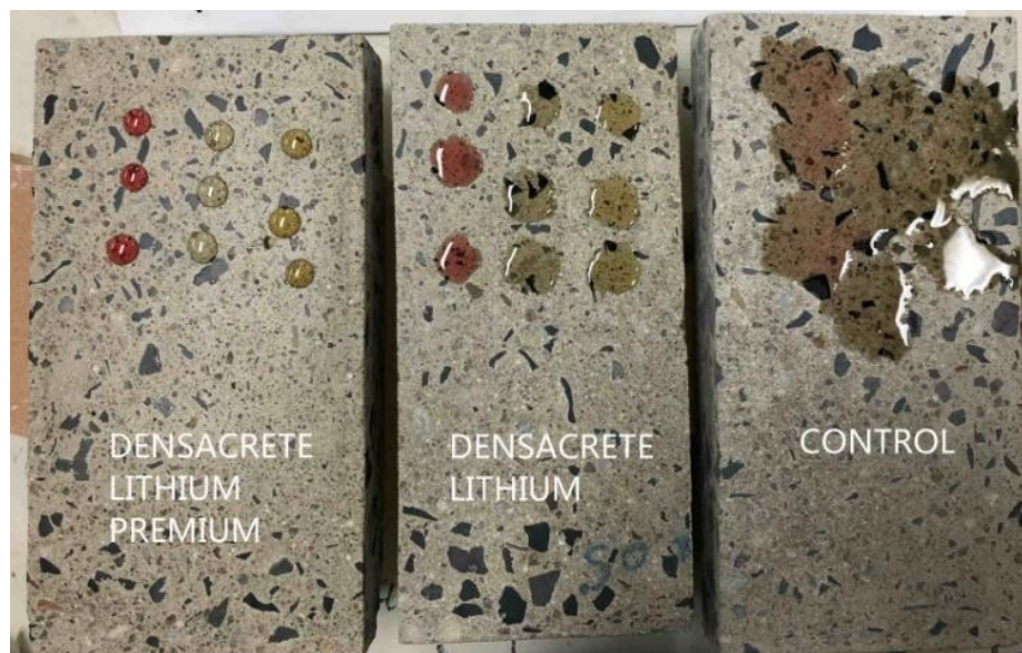
Figure 3. Oil beadings (engine oil, olive oil & heavy engine oil) after 24 hours